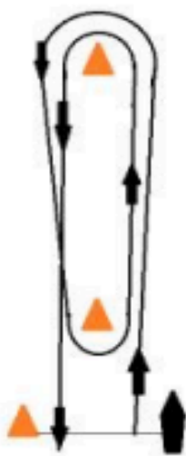
W Windward/Leeward twice (2) around